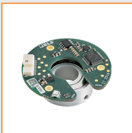
Orbis true absolute rotary encoder