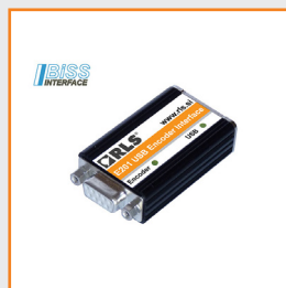
E201-9B USB interface