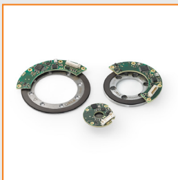
AksIM-2 off-axis absolute magnetic encoder