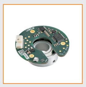
Orbis true absolute rotary encoder